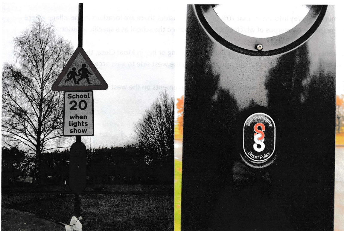
Automated Sign plus Speed Reduction

The cost of this unit is approximately £1,000.00. And can be seen in the images below.